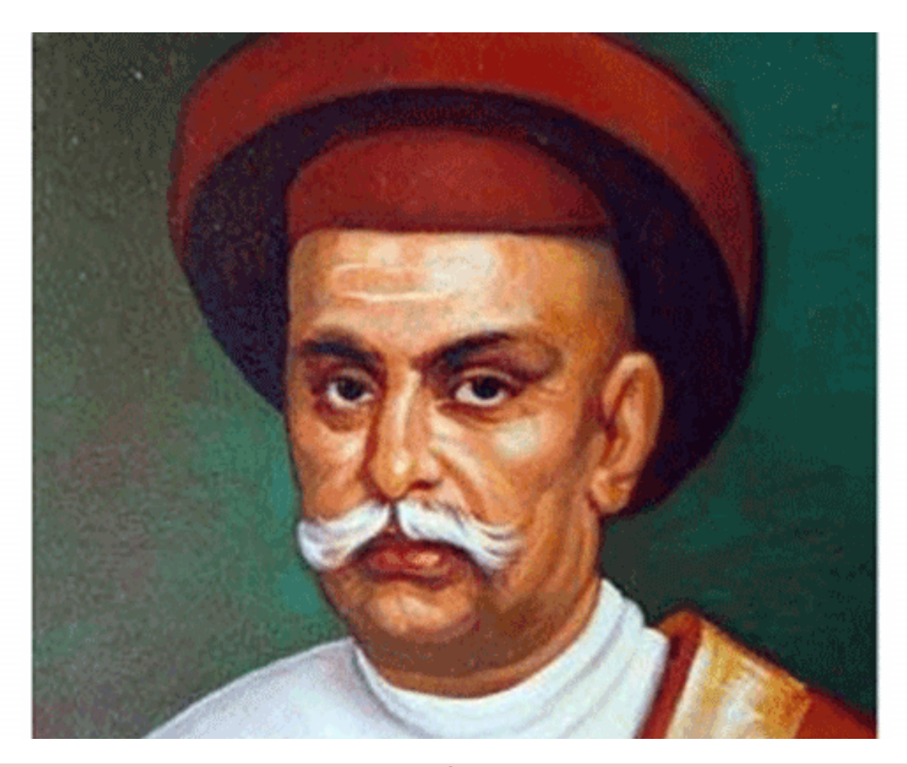
Persons in News