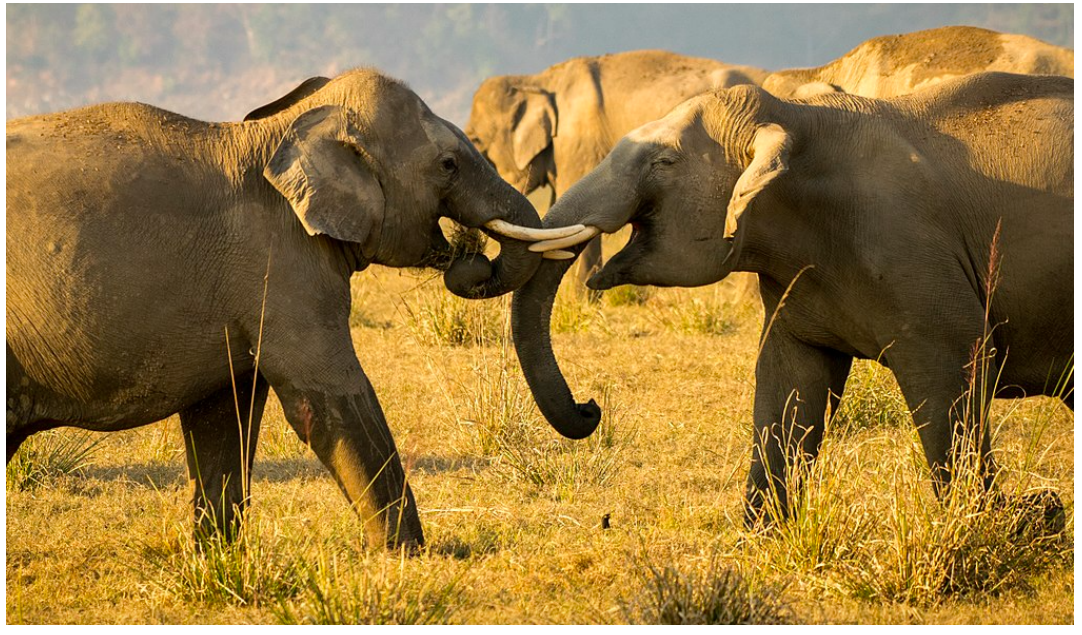
[Ref-The Wire Science]